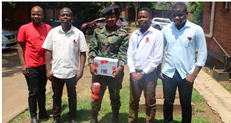
IPOR staff participated in Poppy week, supporting soldiers who dedicated their lives in World War I