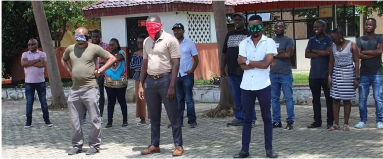
IPOR staff during team building exercise engage in blindfolding games