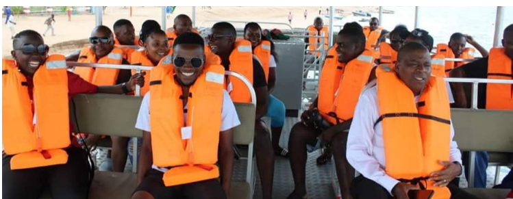
IPOR staff enjoy a boat ride on Lake Malawi during team building exercises