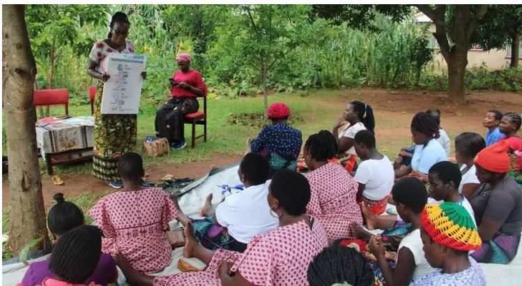
Metaketa V study field training